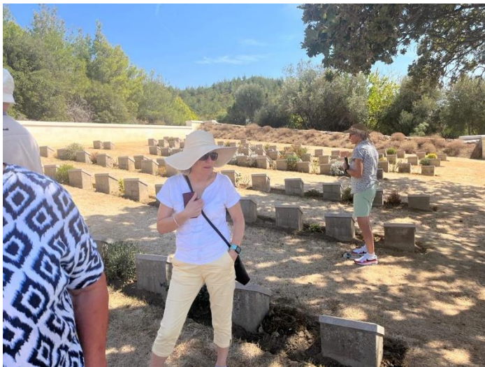
Gallipoli, Anzac Bay