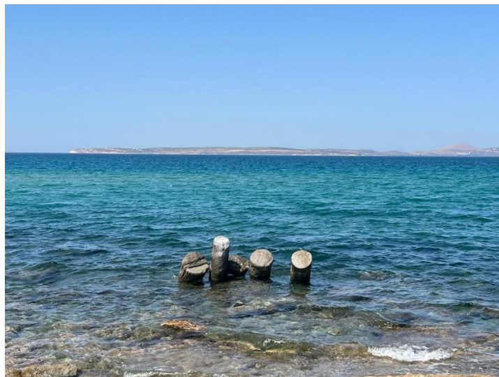
In the steps of St Paul, Canakkale.