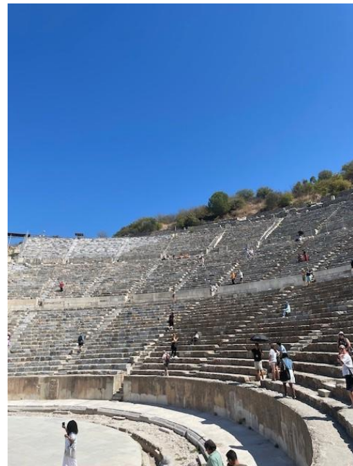
The theatre in Ephesus where St Paul preached