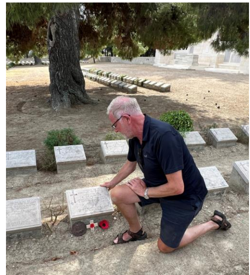
The grave of Roger's great-uncle Edgar at Gallipoli