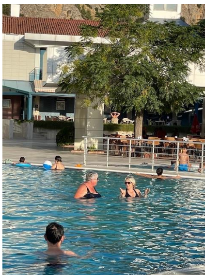
The rigours of pilgrimage