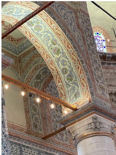
The Blue Mosque

I found it very exciting to be in Asia Minor, the cradle of so many civilisations, and would love the opportunity to see more.