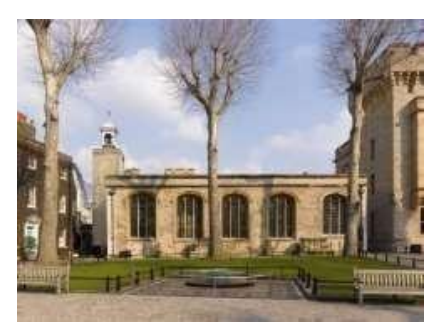
1 Tower Green

HM Tower of London EC3N 4AB 07908 413045 Roger.Hall@hrp.org.uk Twitter @RogerHall53