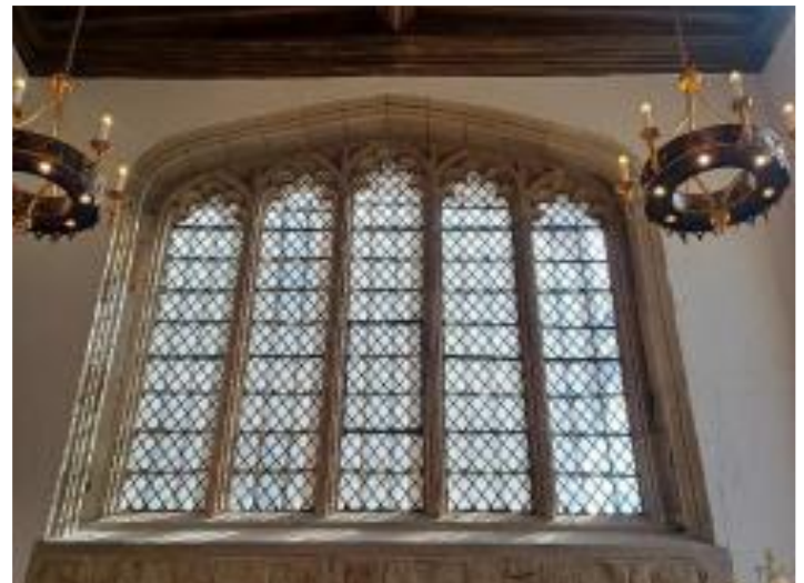
Window I East (full repair)

The East Window in the chapel is to be removed and restored. The chapel needs to be rewired and the damp in the south-west corner attended to. The tower (which was covered in scaffolding) will be recovered in scaffolding for new cladding to be added, and the roof of the chapel is to have repairs to the lead roofing, with the poor 1970s installation removed and replaced. Finally, this will also be an opportunity for much-needed work to be done on the chapel organ.