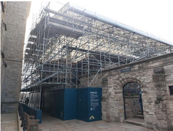
Back of the Chapel