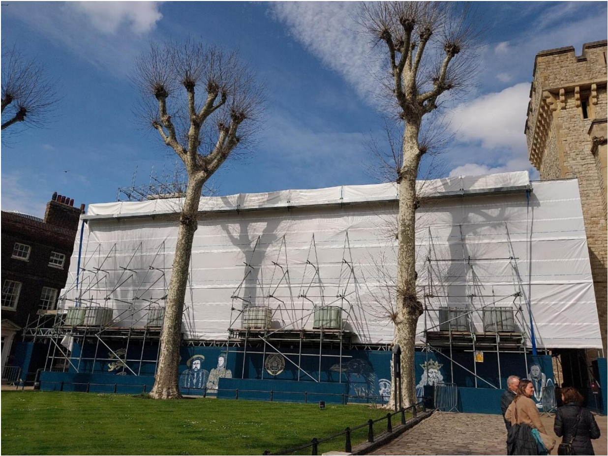
South side of Chapel

The scaffolders are now working on covering the scaffold with hoarding and protective covering, as well as 'What's happening here' information boards.