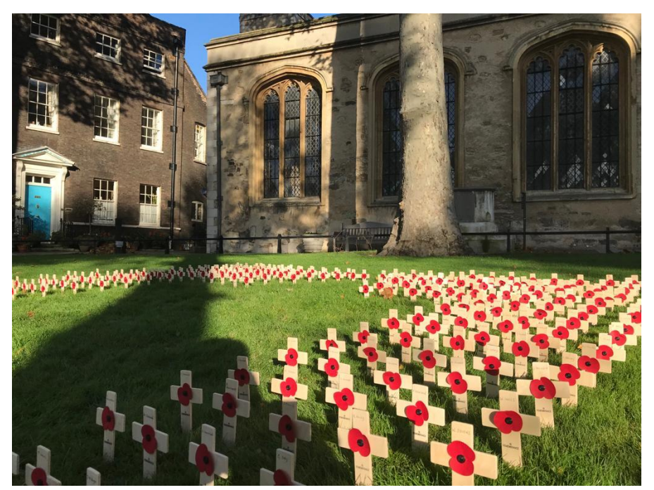
The Garden of Remembrance

This coming Sunday is Remembrance Sunday . We shall hold our main service at 1050am outside the Chapel and opposite the Garden of Remembrance set up by the Yeoman Warders. This an important day for the Tower community as so many of us have military connections, and a large number of us know people who have died serving their country. On Monday evening, we held a short service, in the dark and drizzle, asking God's blessing on the Garden and on those whom we remember. It's important to remember that we join with people all over the world at this time of remembrance, in both small and large numbers. I myself recall most vividly standing by the side of two graves, which were beautifully maintained, on a small island off the west coast of Scotland, where a fighter plane had crashed during the Second World War. We must never forget the sacrifice made by so many.