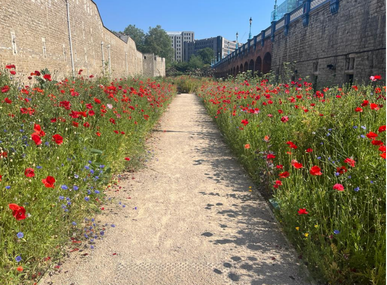
The flowers in the moat are in full bloom, as are the flowers outside the Chaplain's house!

Pictured left is the Camellia by the Chaplain's door.