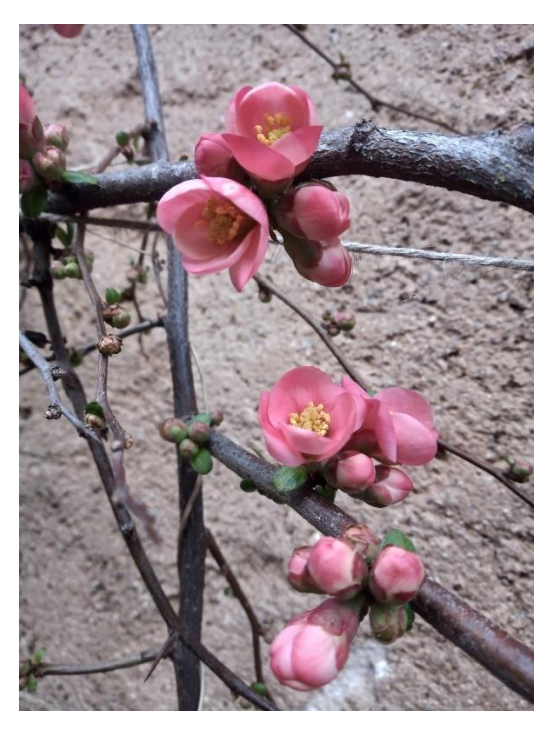
<u>ligsaw</u> <a href="https://www.jigsawplanet.com/?rc=play&pid=363eba344155">https://www.jigsawplanet.com/?rc=play&pid=363eba344155</a>