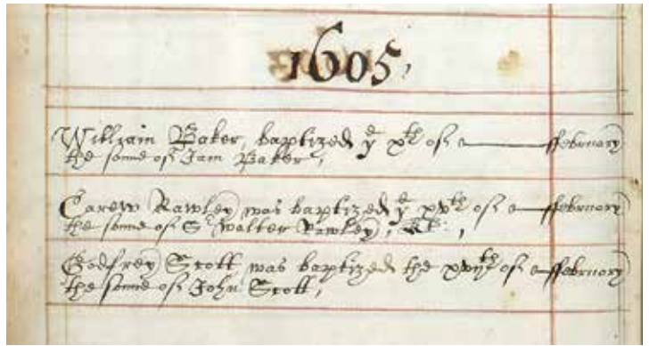
Above: An entry into the Chapel's register for the baptism of Sir Walter Raleigh's son, Carew Raleigh, in 1605.